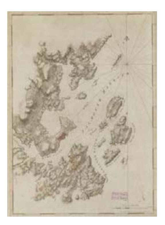
18. J.F.W. Des Barres Falmouth Harbour London, 1777 [2nd state]