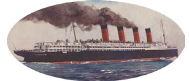
2 Cunard Line