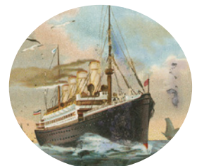
4 Bremen Line

Have you ever wondered why some ships have a few capital letters in front of their name? The capital letters are the ship's prefix, and they describe what sort of vessel the ship is.