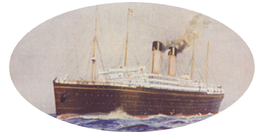
1 White Star Line