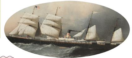
3 Red Star Line