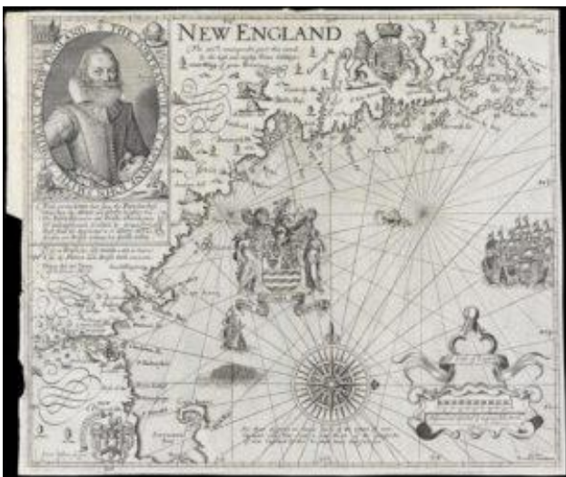
1637 , John Smith, “New England” – http://oshermaps.org/map/12548