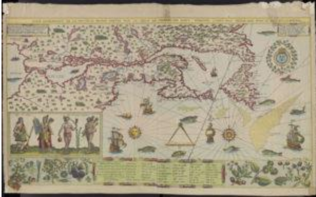
1612 , Samuel de Champlain, “Carte géographique de la Nouvelle Franse” – http://oshermaps.org/map/4072