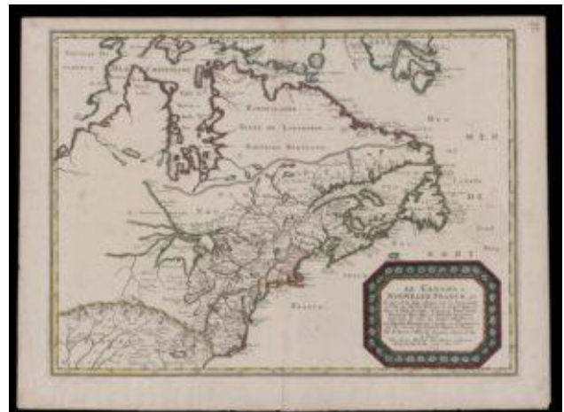
1656 , Nicolas Sanson, “Canada, or New France” – http://oshermaps.org/map/4078