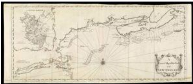
1731 , Cyprian Southack, “A Correct Map of the Coast of New England” – http://oshermaps.org/map/629