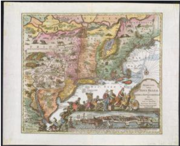
1730 , Matthaus Seutter, “Recens Edita totius Novi Belgii in America Septentrionali” – http://oshermaps.org/map/4719