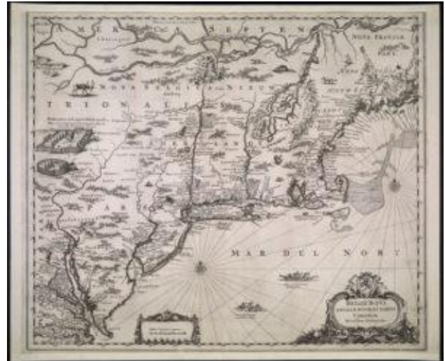
1651 , Jan Jansson, “Belgii Novi, Angliae Novae” – http://oshermaps.org/map/437