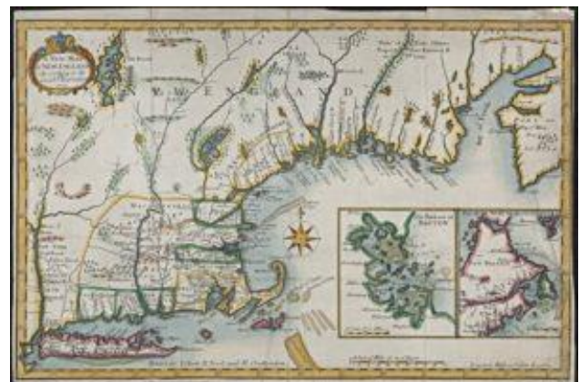
1720 , James Clark, "A New Map of New England According to the Latest Observations" – http://oshermaps.org/map/1830