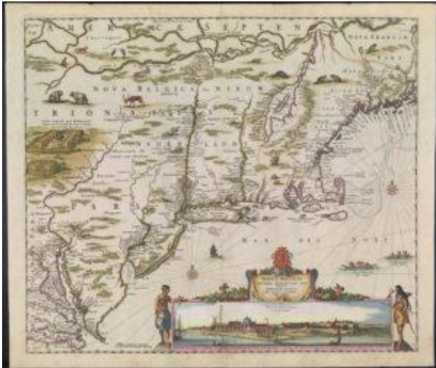
1662 , Hugo Allardt, "Nieu Amsterdam op't Eylandt Manhattans" – http://oshermaps.org/map/459.0001