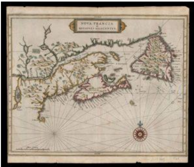
1630 , Joannes de Laet, “Nova Francia et Regiones Adiacentes” – http://oshermaps.org/map/43477