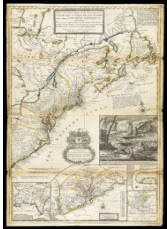
1732 , Herman Moll, “A New and Exact Map of the Dominions of the King of Great Britain on ye Continent of North America” – http://oshermaps.org/map/632