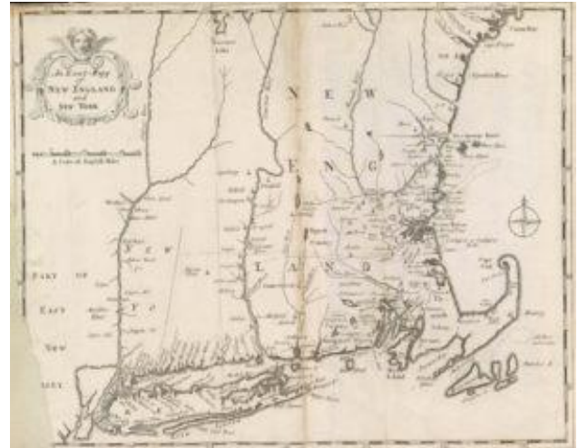
1702 , Cotton Mather, "Magnalia Christi Americana" – http://oshermaps.org/map/1807.0006