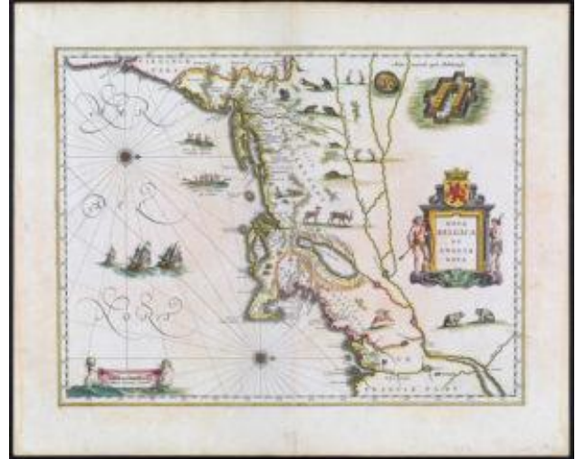
1638 , Willem Janszoon Blaeu, “Nova Belgica et Anglia Nova” – http://oshermaps.org/map/408