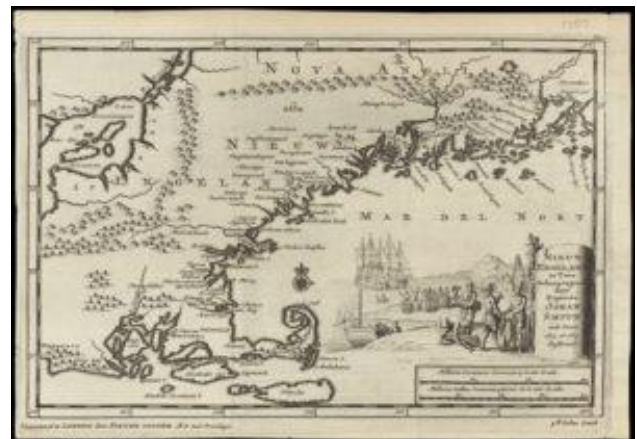
1707 , Pieter Van Der Aa, "Nieuw Engeland in Tweek Scheeptotgen door Kapitein Johan Smith" – http://oshermaps.org/map/578