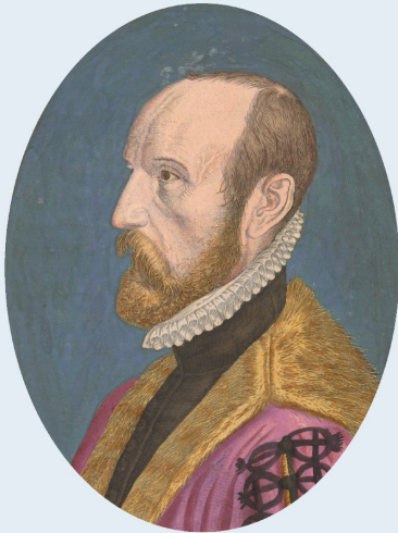
ABRAHAM ORTELIUS, 1595